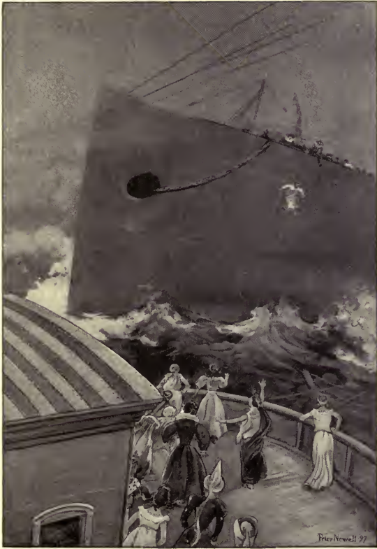
“ A GREAT HELPLESS HULK TEN FEET TO THE REAR ”